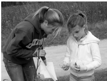
Buddies discussing the milkweed plant at Elawa Farm

This past fall, over 750 students engaged in the study of the life cycle of the milkweed out at Elawa Farm, enhancing their existing environmental science curriculum. This very unique multi-district, K-12 initiative, includes service learning as well as an emotional wellness piece that has surfaced from the Elawa Buddies program. The Elawa Bud-